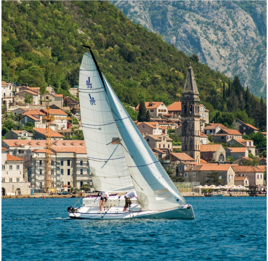
ABOVE Sailing in Montenegro. LEFT E-foiling in Mexico.

And while all sorts of sport-specific programs are out there, the summer season is particularly well suited to trip-worthy spots like these, where the focus is being on—or in—the water.