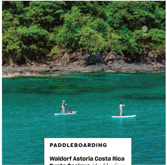
ABOVE Paddleboarding in Costa Rica.